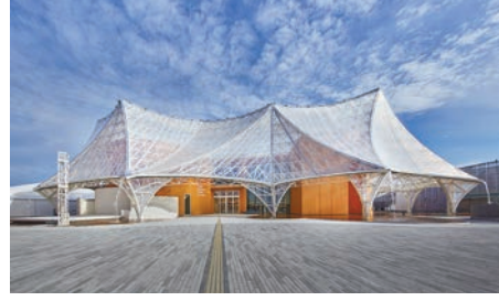
Left: The Osaka Health Care Pavilion will combine displays about cutting-edge health innovations with entertainment. Right: Dotonbori is known as the center of Osaka's nightlife scene.

These events will give visitors special opportunities to enjoy a variety of music, culture and festivals at the expo, so we hope you will visit the site more than once.