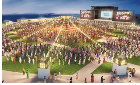
Left: The Grand Ring that surrounds the main expo grounds is the world's largest wooden architectural structure. Right: A massive demonstration of traditional dance is planned for the summer. EXPO 2025