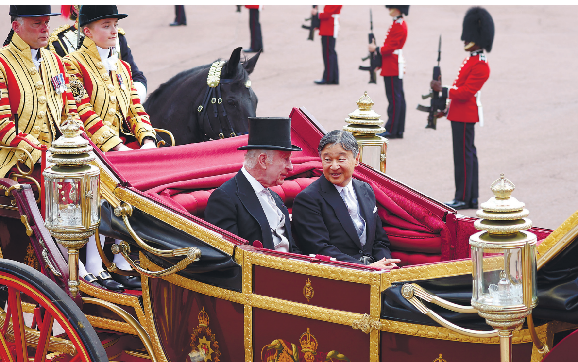
Emperor Naruhito chats with King Charles III as their carriage arrives at Buckingham Palace in London on June 25.