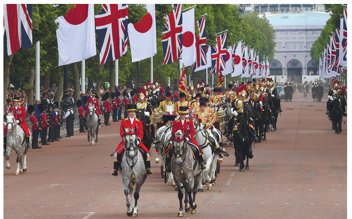
Left: The imperial couple revisit their old stomping grounds at the University of Oxford on June 28 before leaving the U.K. after an official visit. Right: A procession for Emperor Naruhito, Empress Masako, King Charles III and Queen Camilla heads for Buckingham Palace through the Mall in London on June 25.

Best wishes to Emperor Naruhito on his majesty's birthday