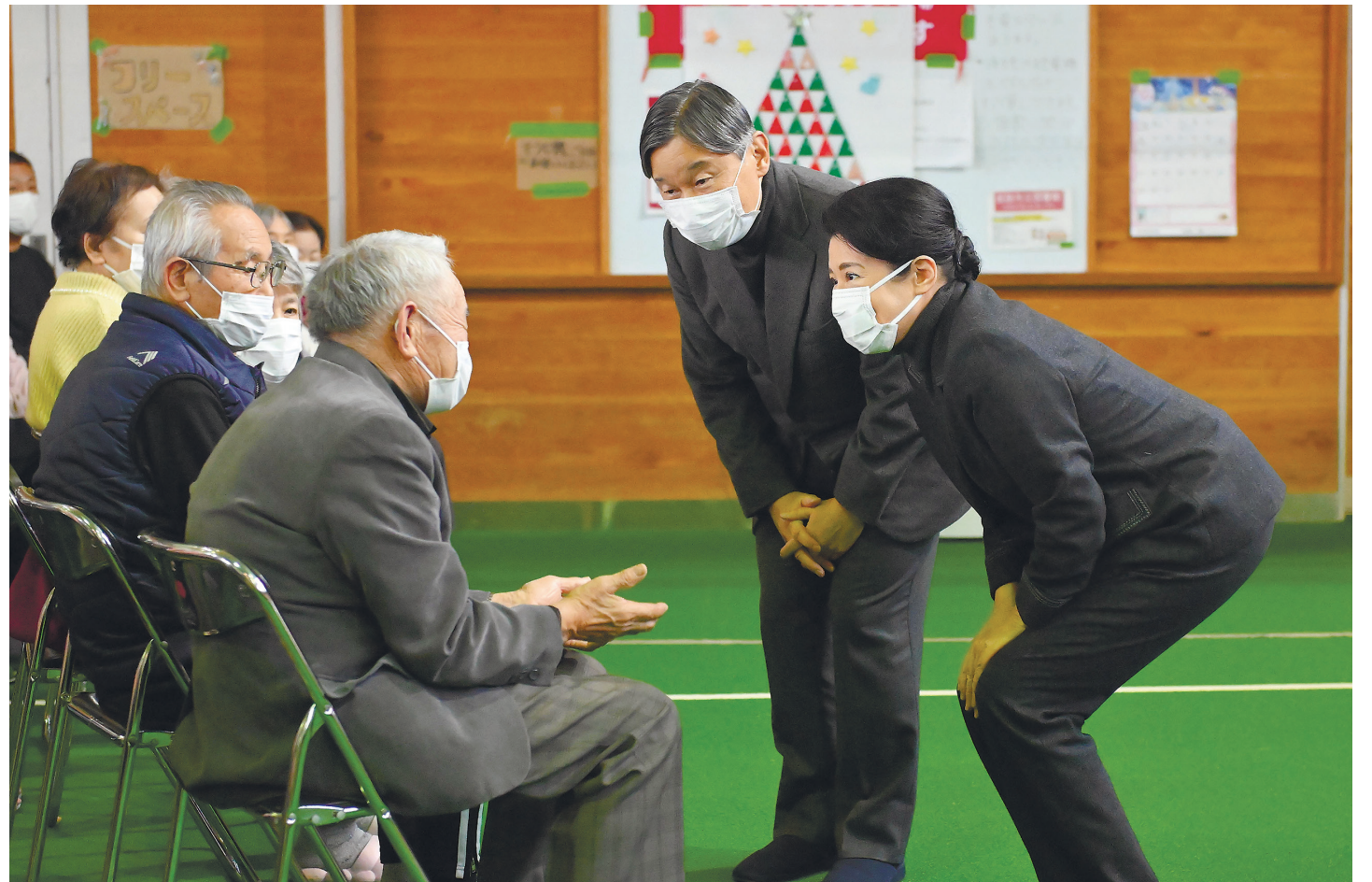
The emperor and empress visit flood evacuees at Wajima Junior High School in Wajima, Ishikawa Prefecture, on Dec. 17.

The Imperial Household Agency's Instagram account shares photos and videos taken primarily during the official activities of the emperor and empress, contributing to connecting the public and the imperial family.