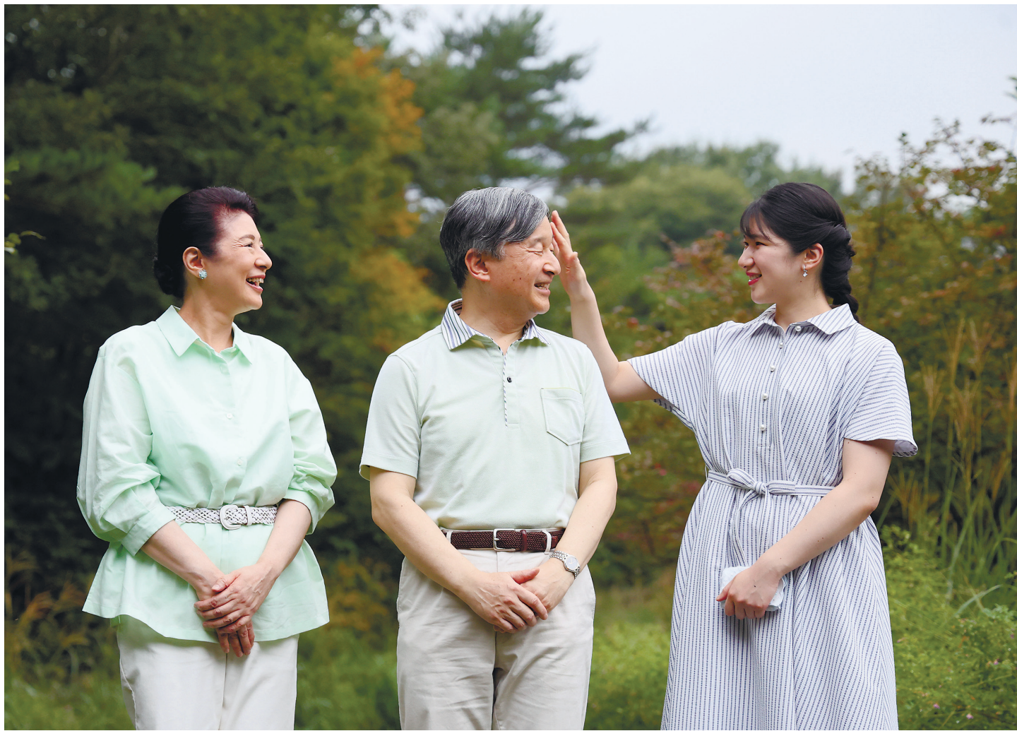
Empress Masako, Emperor Naruhito and their daughter, Princess Aiko, chat during a walk through the grounds of the Nasu Imperial Villa in Nasu, Tochigi Prefecture, on Sept. 12. 川井