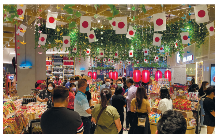
Japanese food fairs have resumed at high-end supermarkets along with other physical promotional and matching events to promote economic ties. JAPAN EXTERNAL TRADE ORGANIZATION

JETRO is also strengthening its efforts in the field of digital transformation. There