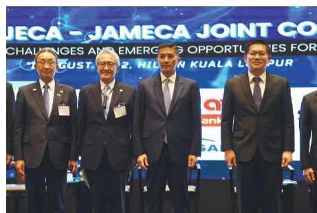
Mohamed Azmin Ali attends the opening ceremony of the 39th MAJECA-JAMECA Joint Conference in Kuala Lumpur on 1 August 2022

Benefits have accrued over the years with technology transfers in strategic sectors that have constantly contributed to the overall industrial development of Malaysia. The LEP