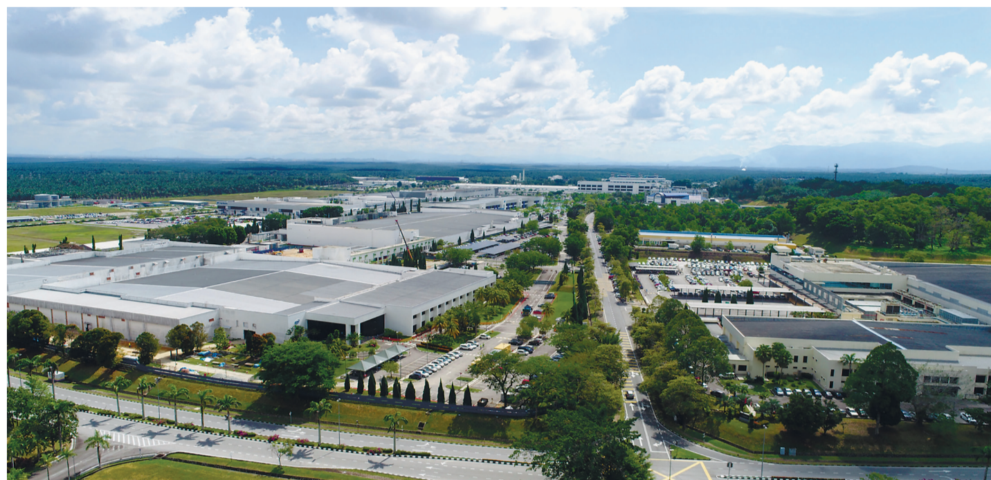
An aerial view of Kulim Hi-Tech Park, which is home to many multinational companies in Kedah state.

KHTP SME Park encompasses 14 factory lots with three types of building models available for rent: detached, semidetached and warehouses. The warehouses will be built based on a customized build-to-suit model according to the investors' building specifications. Several Japanese investors have already shown interest in the offerings, with two Japan-based companies opting