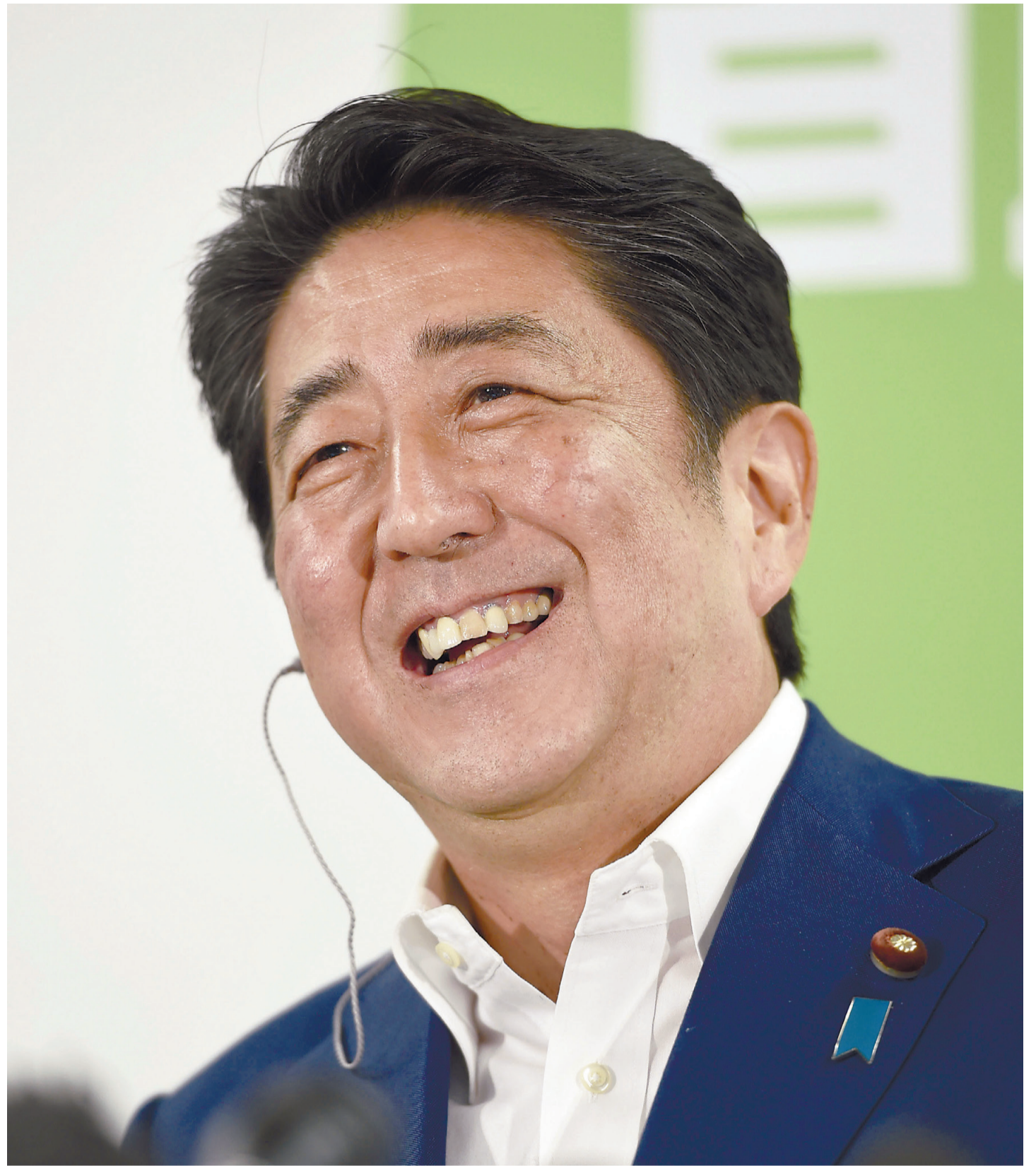
Above: Then-prime minister Shinzo Abe smiles during a TV interview in Tokyo, following the July 2016 Upper House election. Below: Bangladeshi Prime Minister Sheikh Hasina welcomes Abe in Dhaka during a September 2014 visit.