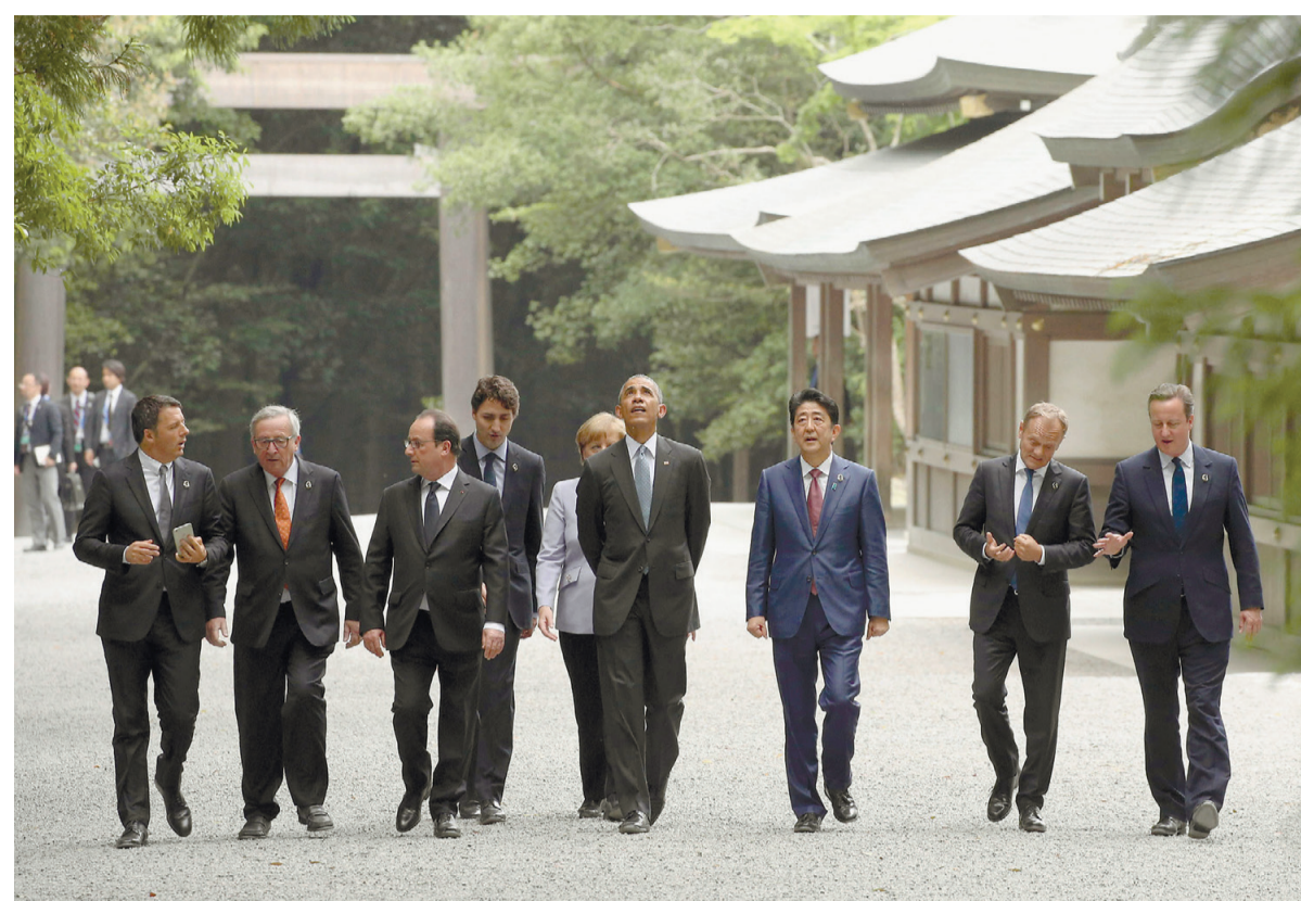
Prime Minister Shinzo Abe visits the Grand Shrines of Ise in Mie Prefecture with the other Group of Seven leaders during the Ise-Shima G7 summit in May 2016.